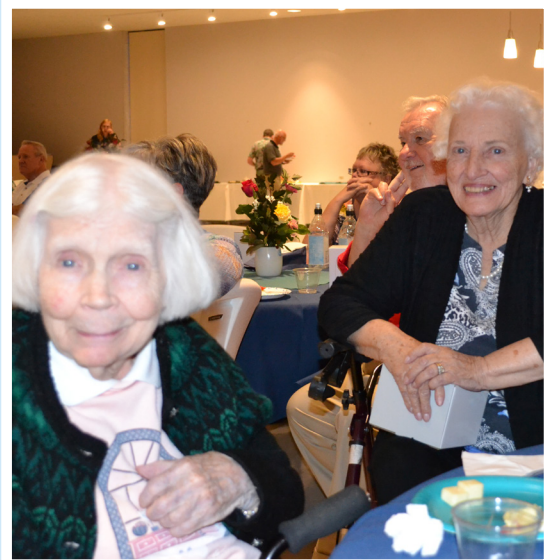
Residents enjoy the food, music, and visiting with friends at the reception..