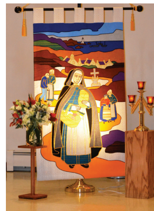
The tapestry made in honor of the 150th anniversary travels to all of the U.S. Homes during this jubilee year.