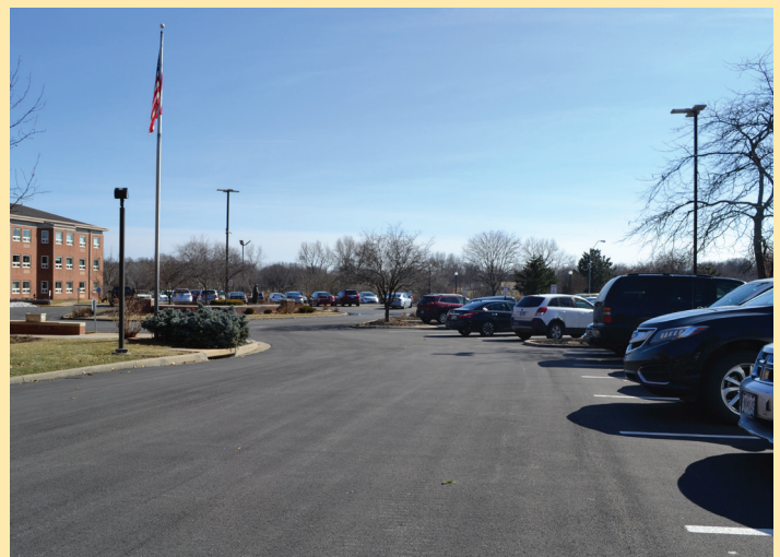
Our beautiful new parking lot

It's so wonderfully smooth now, and safe for driving as well as for walking. All of the sisters, our staff, Residents, and visitors are enjoying it very much. Although the first time our maintenance director had to put ice-melt down this winter on the beautiful, new surface, we swear we saw a tear in his eye!