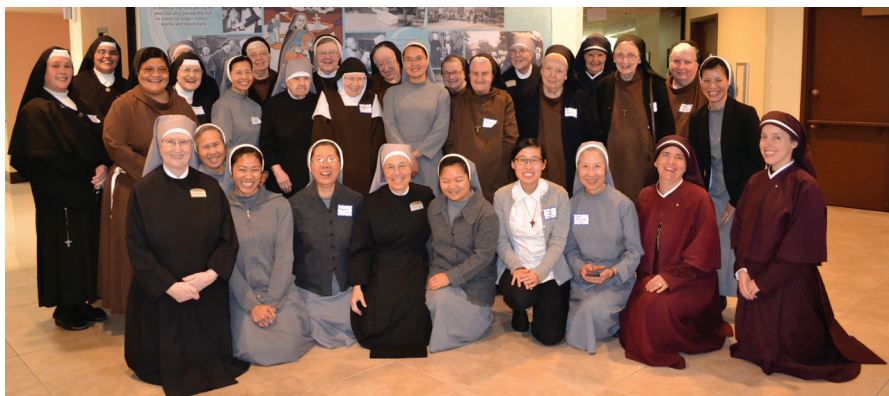
The Council of Major Superiors of Women Religious (CMSWR) meets at the Jeanne Jugan Center.

of our Foundress to our Home which we were able to enjoy for 6 weeks, had a Mass to thank our donors, and hosted area religious sisters for a day of fellowship and learning. We look forward to our upcoming volunteer luncheon, the AJJ promise day, and in August, a community Mass to close out the jubilee year. Thank you to all who have shared in our love for the elderly in so many ways. We couldn't do what we do without you!