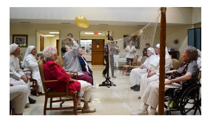
The volleyball game heats up.

It was a wonderful week and a great chance for us to spend some extra "fun time" with our Residents. We're already looking forward to next year.