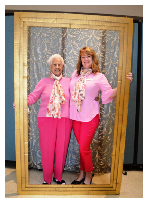
The twins show off their matching outfits.